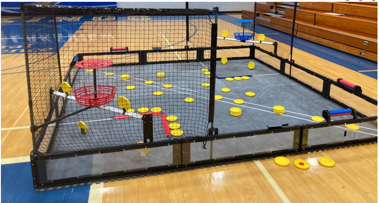
Changes to VRC set up to get the field ready for the OPEN program:

Field is set up the same as for the game VEX Spin Up with the following CHANGES: